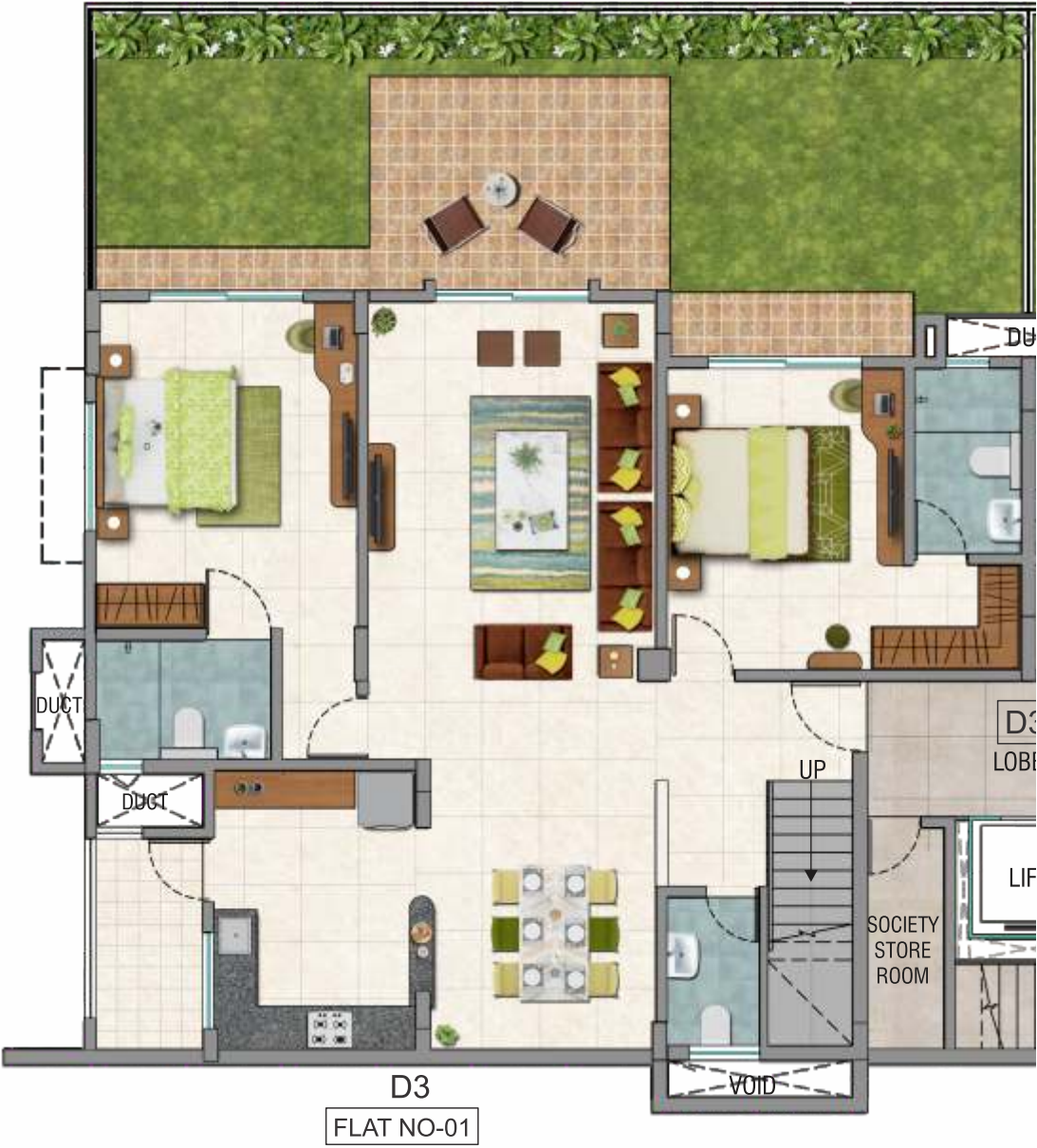
LEVEL 1 / SEMI GROUND