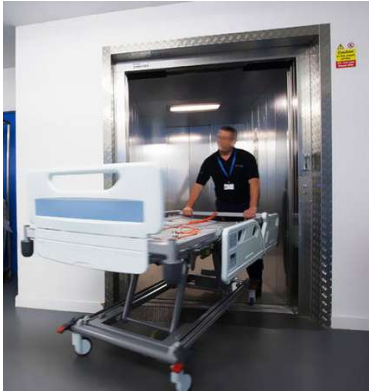
Stretcher Friendly Lifts