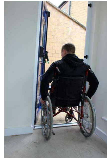
Wheel chair friendly doors