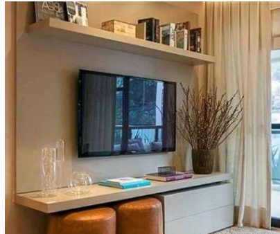
Lounge and TV room.