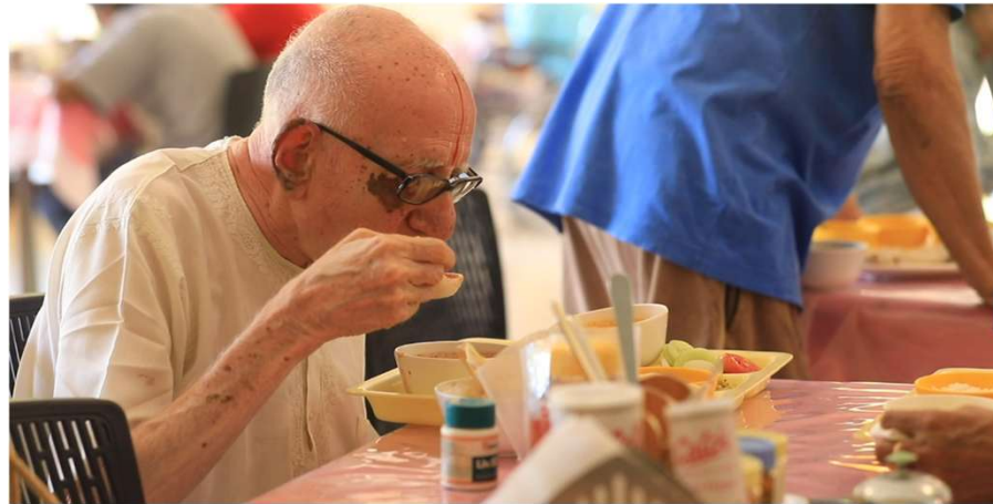
Food & Dining Area