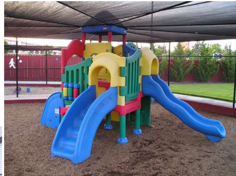
Bond with your grandchildren at the Children's Park