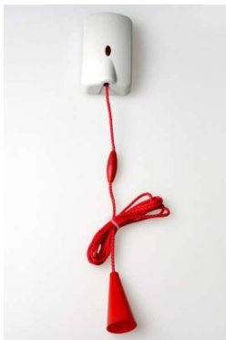
Emergency Alarm bells