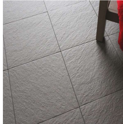
Anti Skid Flooring